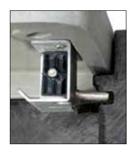
L-Bolt Security System (SHIELD Cover Shown)