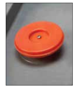
Marker Locator Device