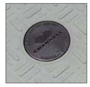
Logo Puck (Custom Options Available)