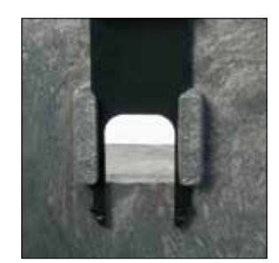
Winterized Cable Drop Slide