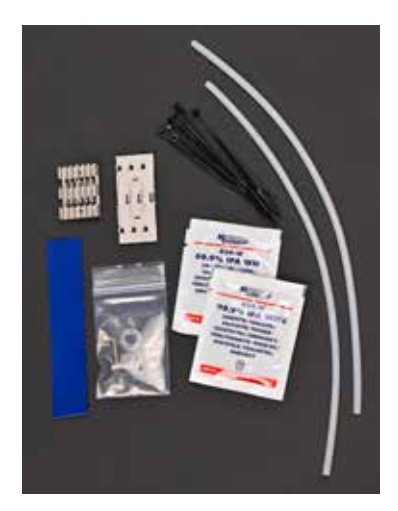
Included with Unit